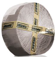
Precured Tread Rubber (PTR)