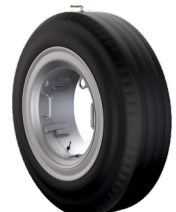
Envelope - Indag Full Skirt Envelopes