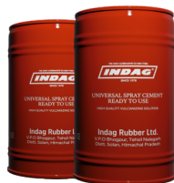
Universal Spray Cement (USC)